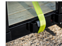
READY RAIL® - CUSTOMIZABLE & ADAPTABLE

Experience the advantage of additional factory-installed fastening solutions, such as D-Rings, Tie-Downs, and Stake Pockets, ensuring versatile and secure cargo management for all your transport needs.