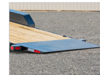
CARGO CONTROL STANDARD

Our 30" Diamond plate knife edge tail makes it super-easy to load low clearance equipment like scissor lifts and fork lifts.