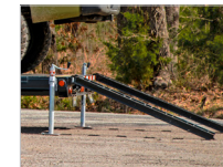
EFFORTLESS LOADING SOLUTIONS

Select from our standard 5' Slide-In Channel ramps or optional Fold-Up Ramps, offering user-friendly solutions for loading vehicles and equipment and boosting your trailer's adaptability.