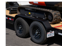
FAST & EFFICIENT LOADING

With the removable fender, loading wider equipment becomes easier as you gain additional width clearance.