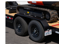
FAST & EFFICIENT LOADING

With the removable fender, loading wider equipment becomes easier as you gain additional width clearance.