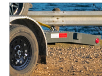
CARGO CONTROL STANDARD

Benefit from enhanced cargo securement with our standard Rubrail. In addition to the built-in stake pockets, the Rubrail provides extra attachment points for securing your load. Customize your trailer further by adding optional D-rings.