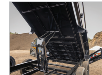
SWING ARM TARP

The Scissor-Lift Hydraulic System provides efficient lifting capabilities and a stable lifting platform with power-up, power-down, and gravity-down functionality for quick dump cycles.