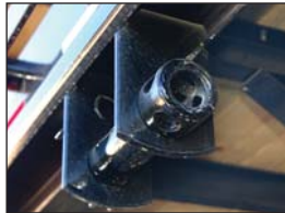
Sliding Strap Ratchets