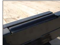
Winch Cable Roller