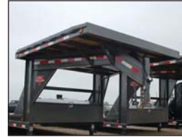
Deck on the Neck (GN Only)