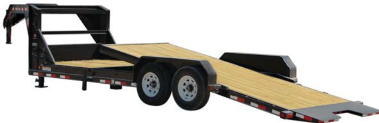
Gooseneck Coupler Available

T6 trailers over 16 ft in length will have a stationary front deck. For full length tilt see the Powered Full Tilt (TF)