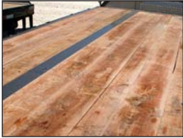
Rough Oak Floor