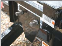
Spare Tire Mount