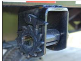
Weld On Strap Ratchets (2)