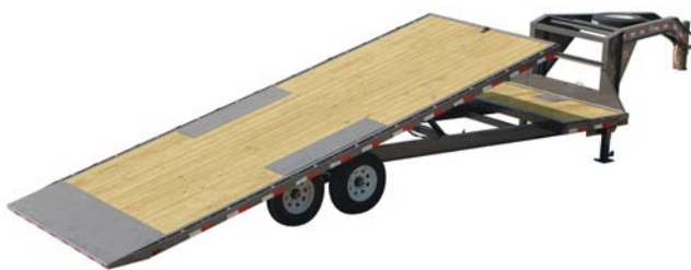
26 ft Grey Gooseneck Deckover Tilt (22' Tilt + 4' Stationary Deck)