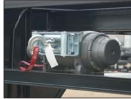
Winch 12VDC (12,000 lb.)