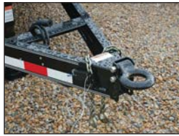
3" Pintle Eye