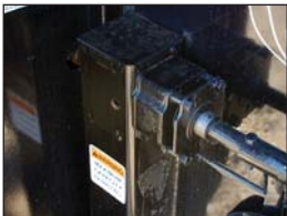
2 Speed Jacks